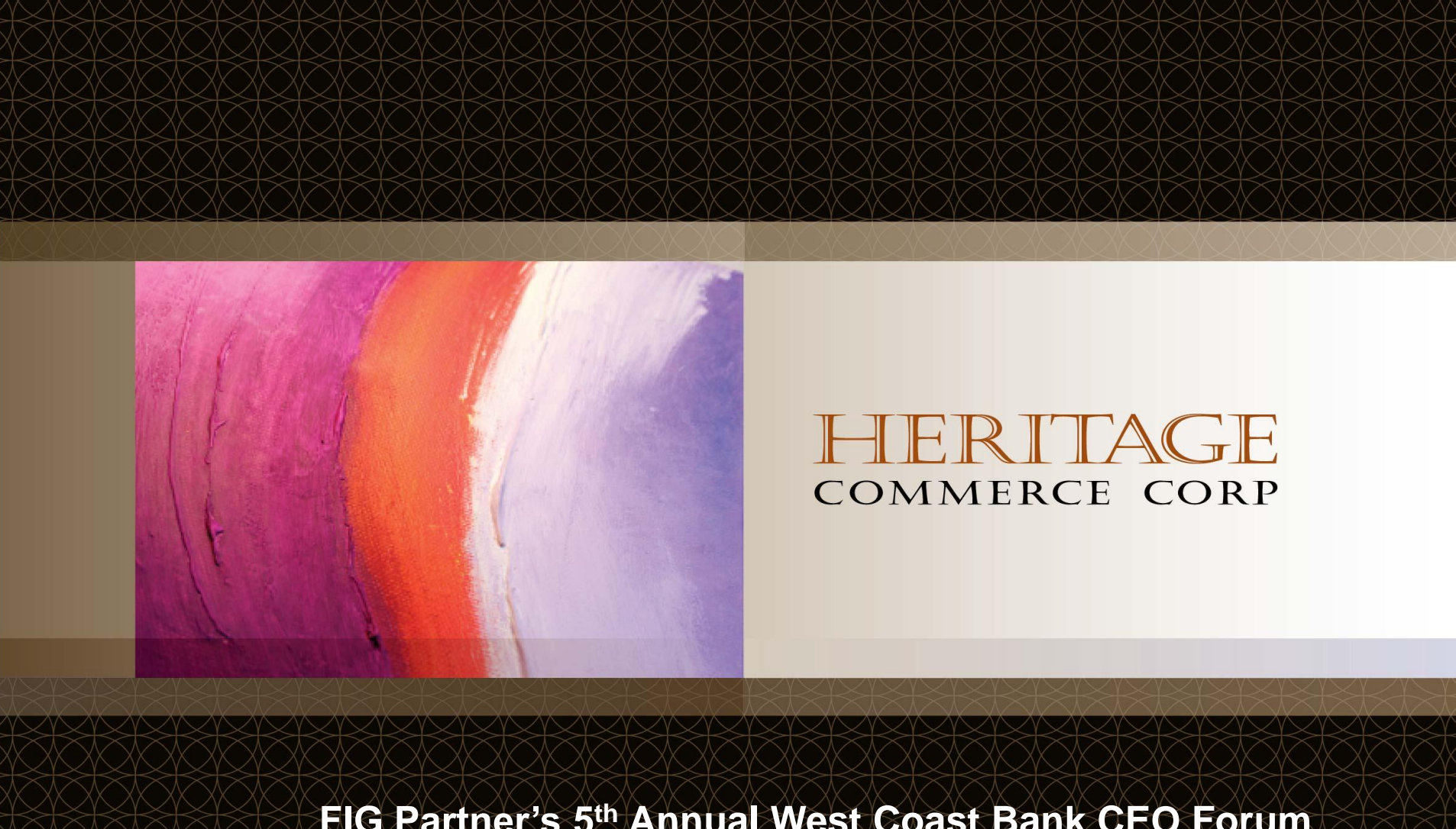
FIG Partner's 5th Annual West Coast Bank CEO Forum February 6, 2014